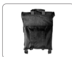
35kg Sand Bag (No Sand)