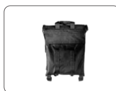
7kg Sand Bag (No Sand)